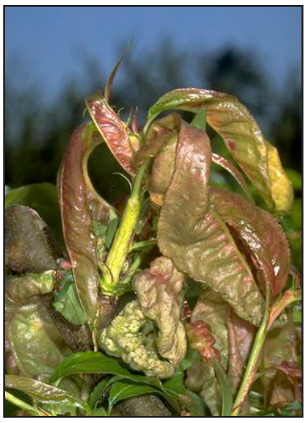
Figure 1. Peach leaf curl symptoms typical of a serious infection.

The peach leaf curl pathogen also infects young green twigs and shoots. Affected shoots become thickened, stunted, distorted, and often die. Only rarely do reddish, wrinkled to distorted (or hypertrophied) areas develop on fruit surfaces. Later in the season these infected areas of fruit become corky and tend to crack (Fig. 3). If leaf curl infection builds up and is left uncontrolled for several years, the tree may decline and need to be removed.