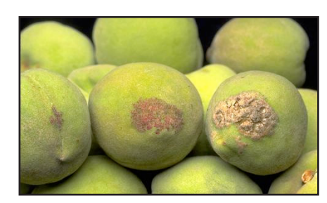
Figure 3. Though uncommon, symptoms on fruit can occur, making the surface corky and cracked.